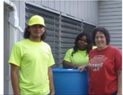
Resident Present with Student Workers

For barrel delivery, you will receive a phone call at least two days prior informing you of what day your barrel will be delivered. If you are unable to be home when delivery occurs, then the barrel will be placed in your backyard but not connected to the downspout diverter.