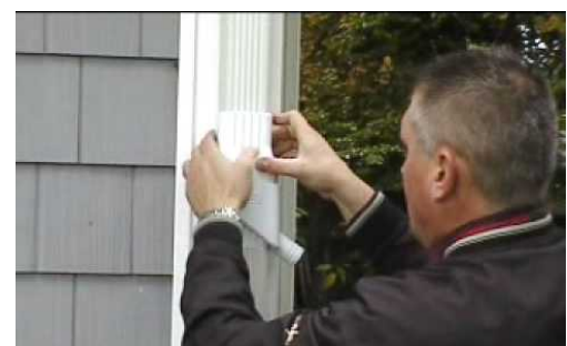
Resident Installing Diverter

Diverter is provided at no charge as part of the program and available at your CDC office before summer. Residents participating in the Summer Rain Barrel Program are responsible for installing the downspout diverter that connects the downspout to the rain barrel. The City of Cleveland and Youth Opportunities Unlimited DO NOT install diverters.